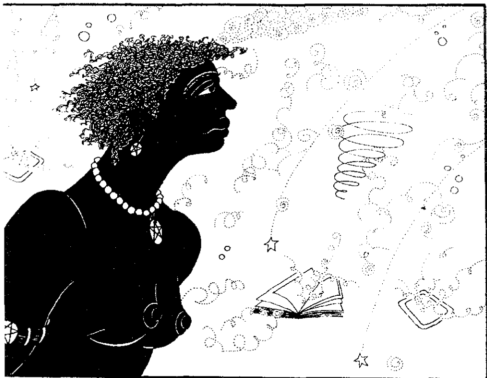
SOOTHSAYER: a woman who Dares to counter the patriarchal deadly sin of deception; Courageous Truth-sayer

Spell-Glance n : an Eye-Beam/Gleam that casts a Sparking Spell