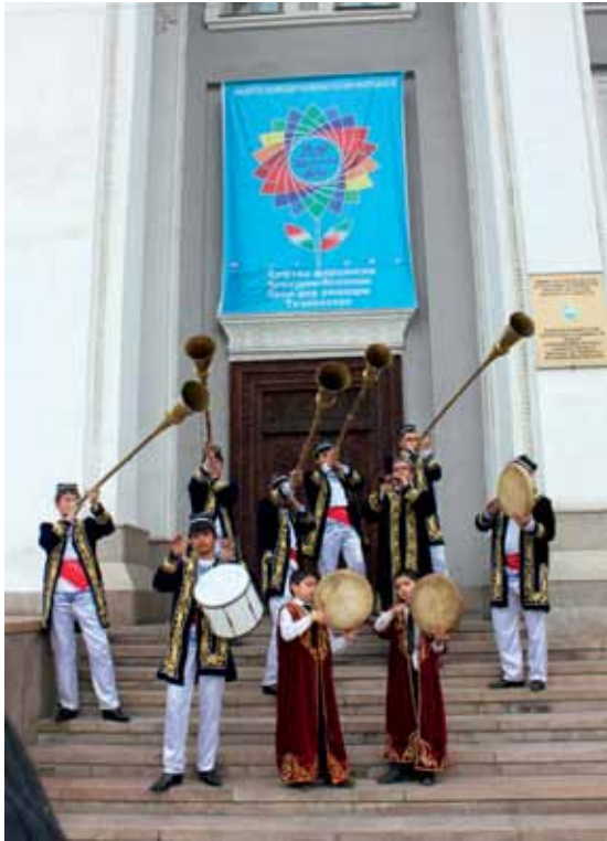
↑ Праздник Навруз, Национальный музей Республики Таджикистан им. К.Бехзода, Таджикистан.