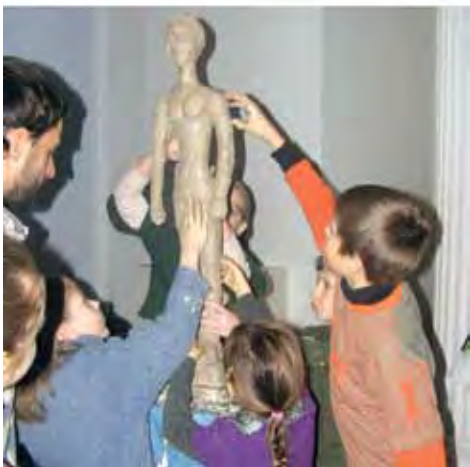
↑ Интерактивные занятия в рамках программы «Живое искусство», Национальный художественный музей Украины, Украина.

It is very important to study how different profile museums use information technology in educational activity and to consider the prospects for distant learning programs in museum education programs and staff development.