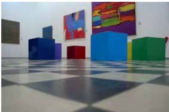
↑ Выставочный просветительский проект для детей «На языке живописи», Национальный художественный музей Украины, Украина.