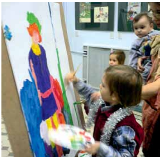
↑ Выставочный просветительский проект для детей «На языке живописи», Национальный художественный музей Украины, Украина.

Presently, institutions of higher education in each of CIS countries have special departments and sub-departments of museum work and monument protection, museum and archive work, etc. However, in most cases, the University education system is far removed from the real situation in museums and their needs. Young museum professionals start to learn the profession when they begin working in a museum. Today the majority of museum staff dealing with the main types of work – scientific and research, preservation and accounting, exhibition and education – have educational backgrounds in history, history of art, technology, etc.; not museum work. One way to solve this problem is for universities to cooperate with museums in developing educational programs, including cooperation between university and museum staff. Museum employees invited to teach at a university can actively help students enter the museum world by explaining the practical peculiarities of museum work.