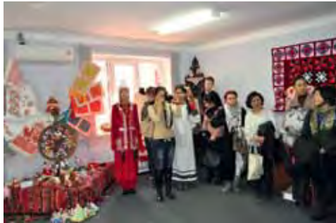
↑ «Хранительницы», проект по развитию музеев Центральной Азии «MUSEUMстан», Казахстан ↑ 'Custodians', the development project of museums in Central Asia "MUSEUMstan", Kazakhstan