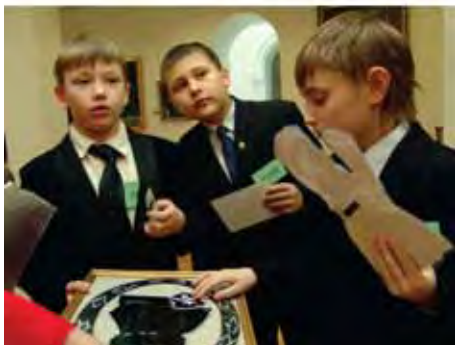
↑ Культурно-образовательные проекты Национального художественного музея Республики Беларусь. ↑ Cultural and educational projects of the National Art Museum of Belarus Republic.

grad, Yoshkar-Ola, Kazan, Tula and Kostoma, where resource centers to support the creative development of children and teenagers with different social and physical abilities were established in 2011.