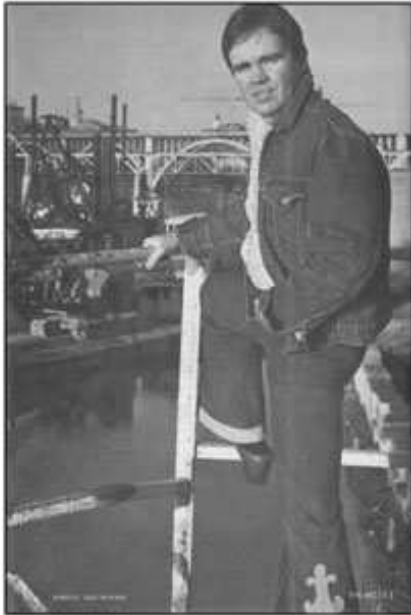
Dust jacket photo from Suttree , 1979. Photo credit: Dan Moore. Used by permission.