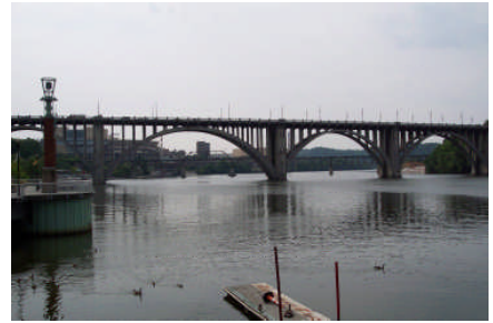
Suttree's bridges: Photos by MSDoyle